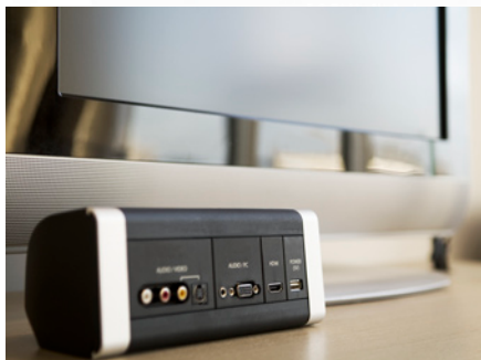
MediaHub Standard with optional desktop housing for easy installation on table or desktop.