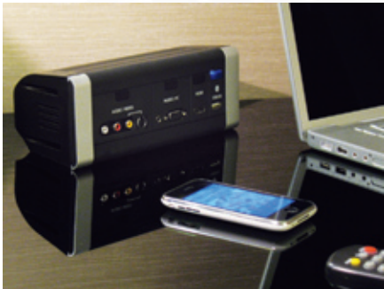
MediaHub HD with optional desktop housing for easy installation on table or desk.